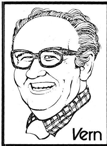
Sketch reprinted from California Mathematics 5(2), October, 1980.

University of Santa Clara, Santa Clara CA 95053